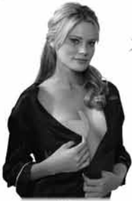
1993 Adhesive Bra

Fashion Forms is a proud sponsor of Pier Under the Stars