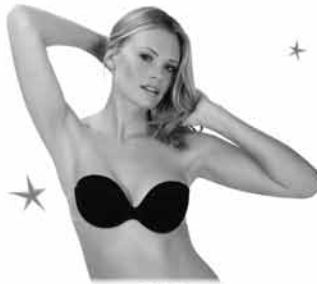
2008 Go Bare Backless Strapless Bra