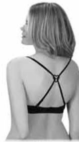
2010 Strap Solutions